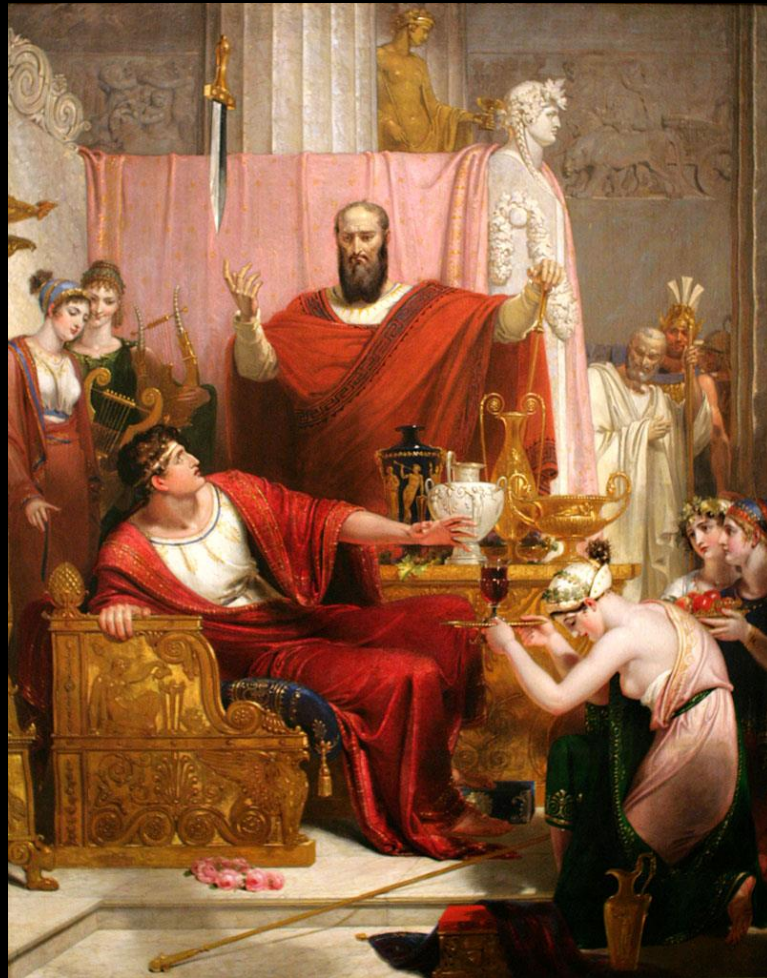
Sword of Damocles by Richard Westall, 1812.